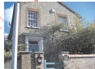
The Old School, Tebworth

8 Turn right and head towards metal gate and track. Cross over track and through gate opposite. Follow footpath diagonally through field (careful – livestock). At top turn right and skirt along hedgerow towards gate in far right corner (ignore first gate on left). Keep to left of field (ignoring marker posts on right) and go through gate and turn left on to The Lane.