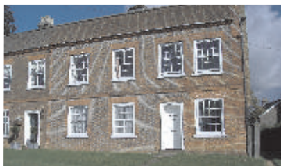
Conger House, Toddington

2 Turn left on to Park Road. Take footpath on right just past Manor Road. Go as far as pond, taking in views of Toddington Manor. Retrace steps to Park Road, turn right. (take care on Park Road)!