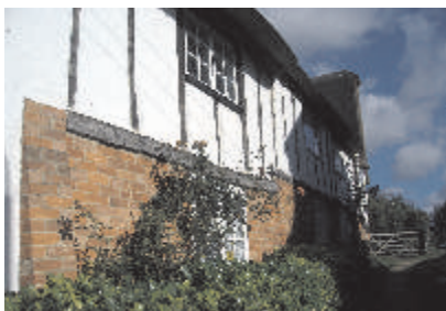
Emmerstone's Cottage, Tebworth

6 Follow footpath to left through field, towards yellow marker post. Follow marker post through next field. As a farm comes into view ahead, follow path on left towards yellow marker post, with Chalgrave Parish plaque on.