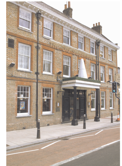
The Old Sugar Loaf