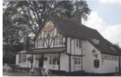
The Old Farm Inn

2 Take road opposite recreation ground, Church Road (signposted Eaton Bray). Continue along road, past Lockington Farmhouse (on left) and Old Farm Inn (on right).