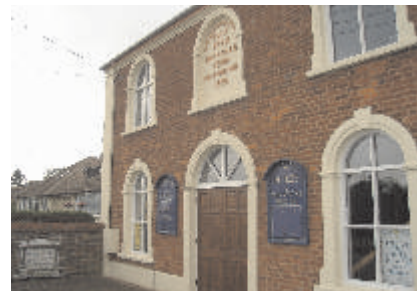
The Wesleyan Chapel

7 Retrace steps up Church Lane, turn left and continue along High Street, passing Market Place and The White Horse on left hand side of road, and further along, The Wesleyan Chapel.