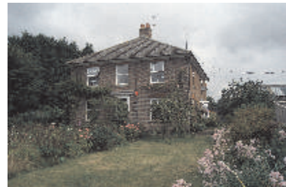
Nash Farm, Kensworth