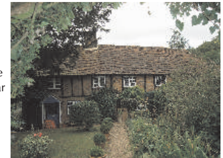
Yew Tree Cottage

If you are feeling particularly energetic, the walk can be extended to include Studham. (see next page)