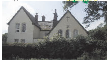
National School, Whipsnade